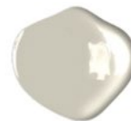
Revere Pewter: BM