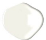
Dove White: BM