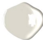
Balboa Mist: BM