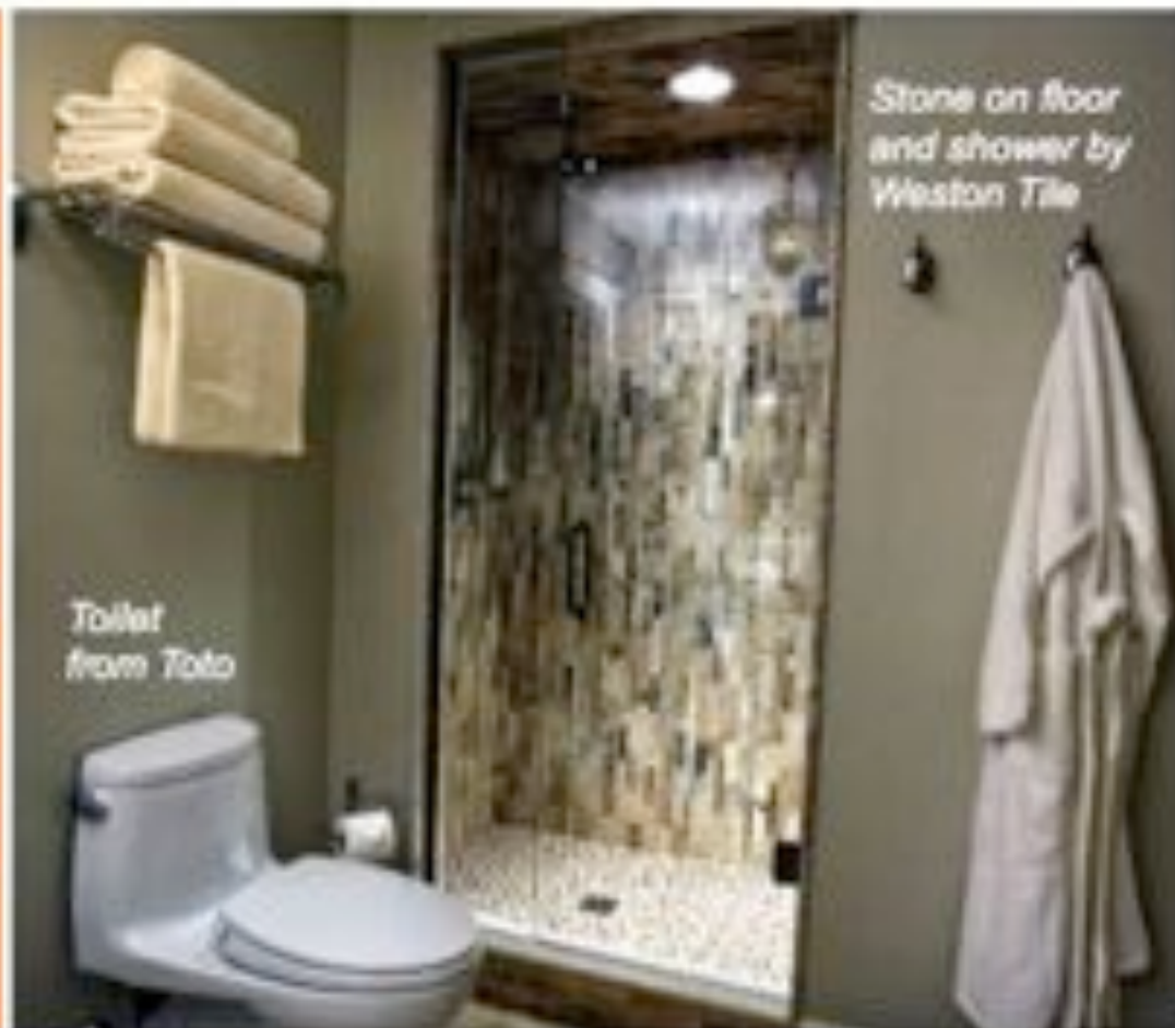
Toilet from Toto

This bathroom started as an historical piece from the eighties with nothing that these homeowners liked about the room, aside from the fact that it had a sink, toilet and shower. All of the finishes need to be updated. Trying to achieve the feeling of a fine French hotel, we used low-voltage heated floors, a revised vanity with painted finish with an under mount sink and integrated mirror and light valance, aged glass door fronts and simple brushed nickel finished faucets. The toilet remained in the same location but we upgraded it to a silent flush toto toilet and we removed as much of the wall to the shower to allow for an open glass enclosure. The tiles in the shower were oriented in a vertical direction with a mosaic version of the same tile for the floor. The rain shower head in the same metal finish gave a timeless quality to the space, marrying form and function. The central chandelier crowns the room giving the homeowners exactly what they had hoped.