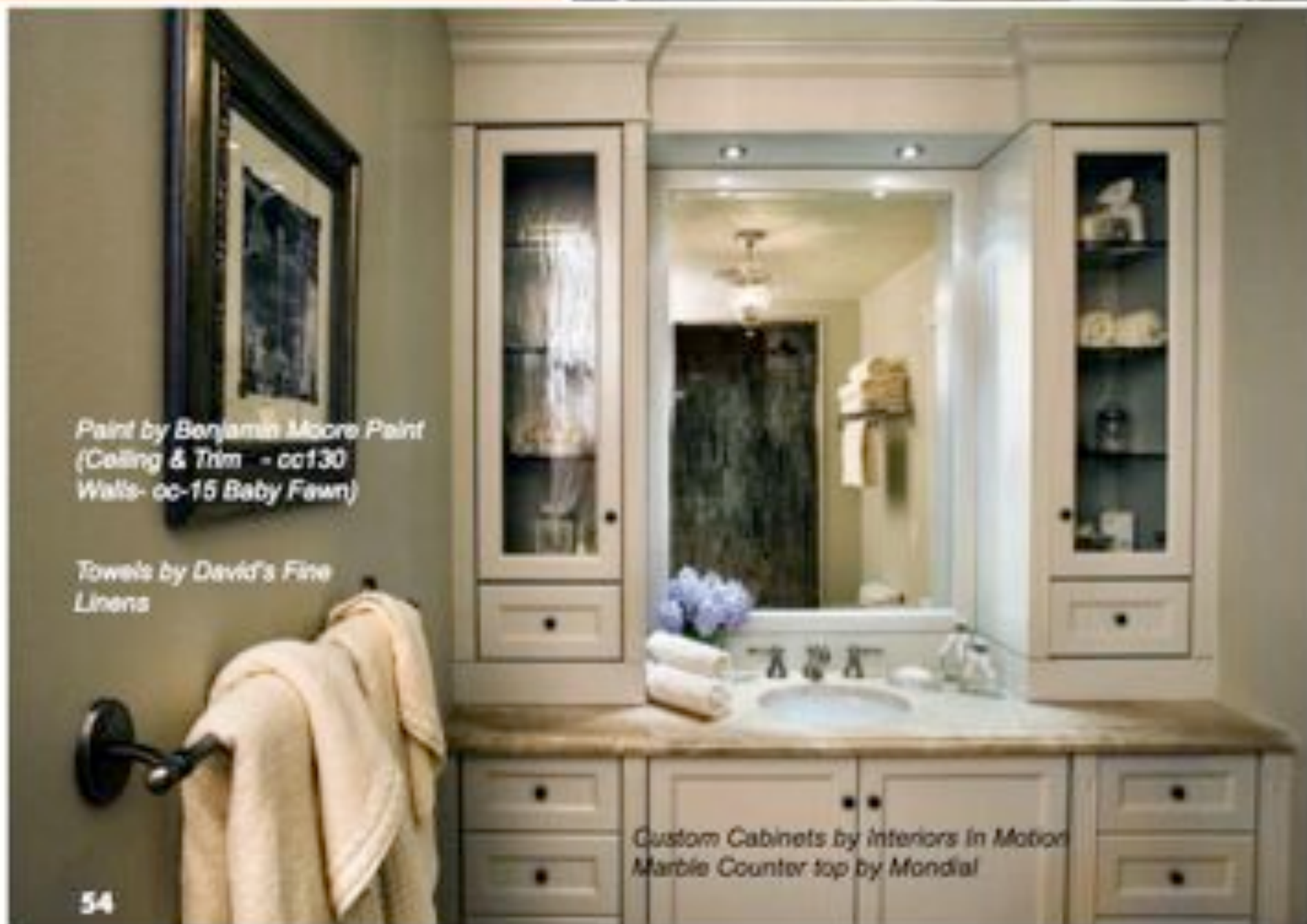
Paint by Benjamin Moore Paint (Ceiling & Trim - cc130 Walls- cc-15 Baby Fawn)