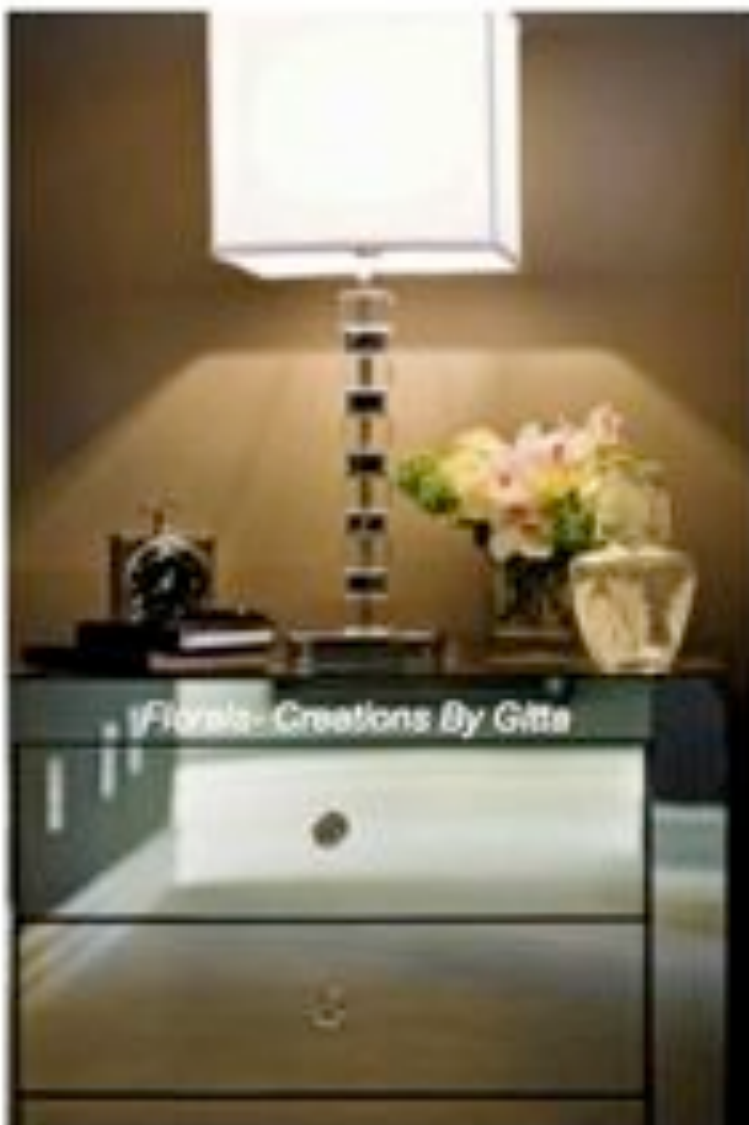
Floral - Creations By Gitta