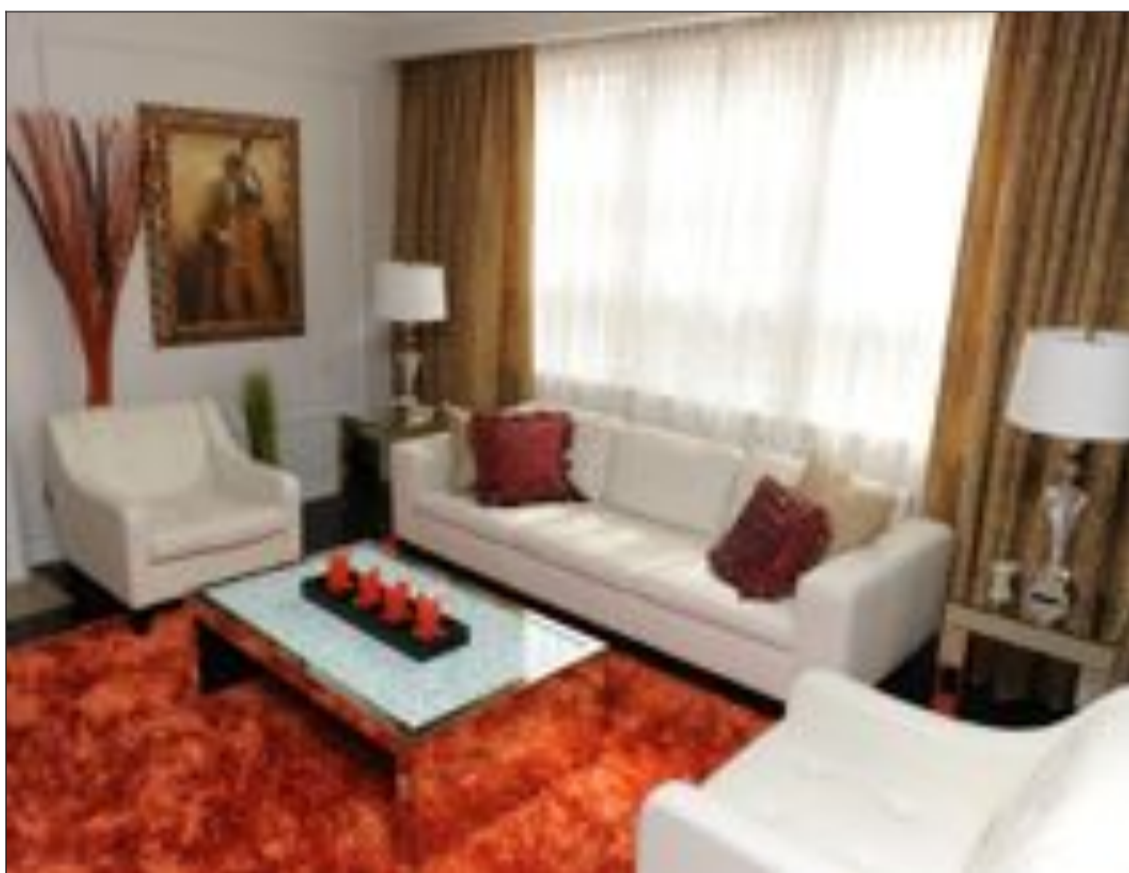
The shockingly orange shag carpet in the living room plays against the stark white of the sofa and chairs. Orange candles, gold drapes and glass tables give the room the 1960s feeling that Dusk loves.