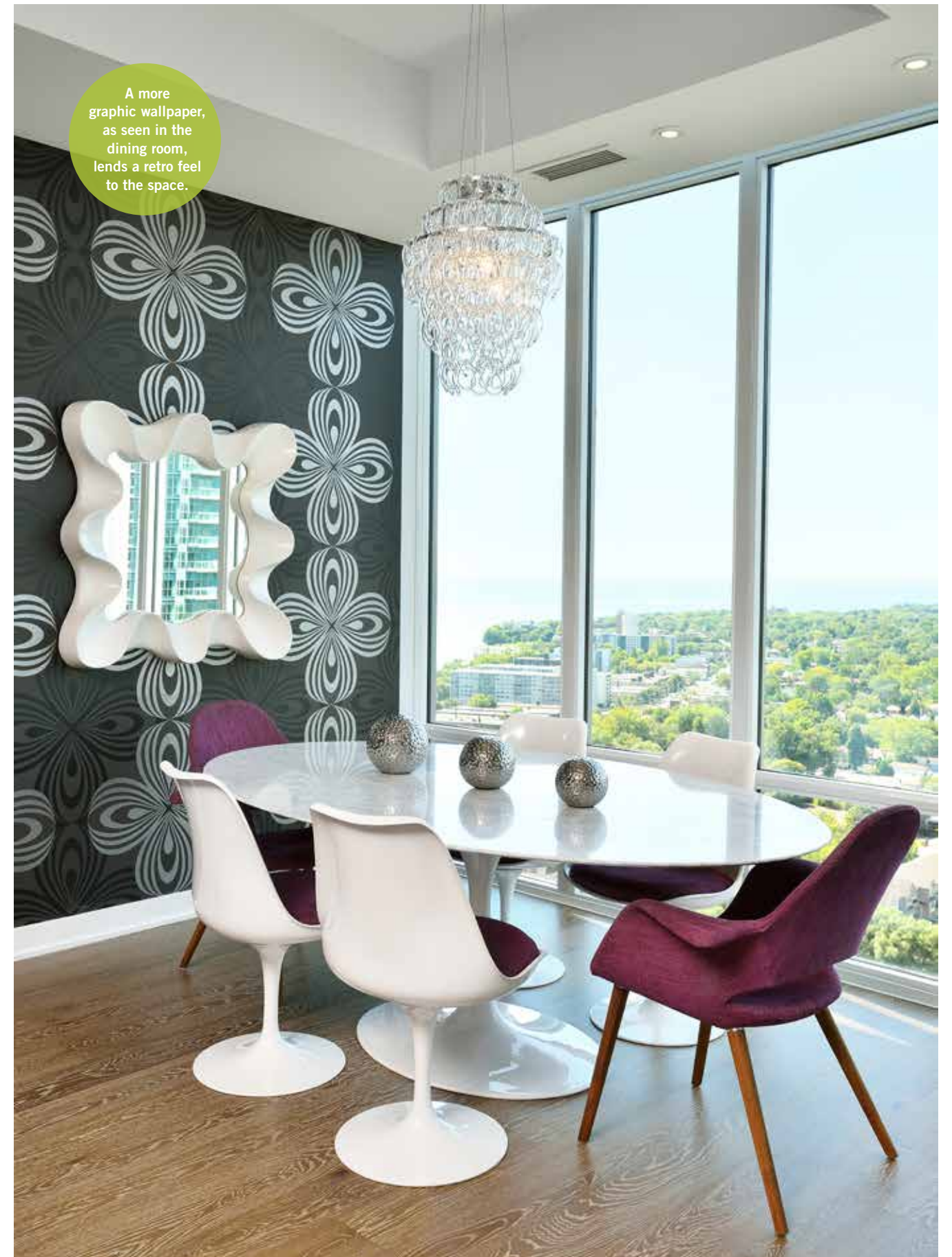
A more graphic wallpaper, as seen in the dining room, lends a retro feel to the space.

Some of the papers that are available provide a definite three-dimension feature, making walls look as though they are carved. The advantage of this extra texture is the way the light plays with the surface, creating highlights and shadows. I often