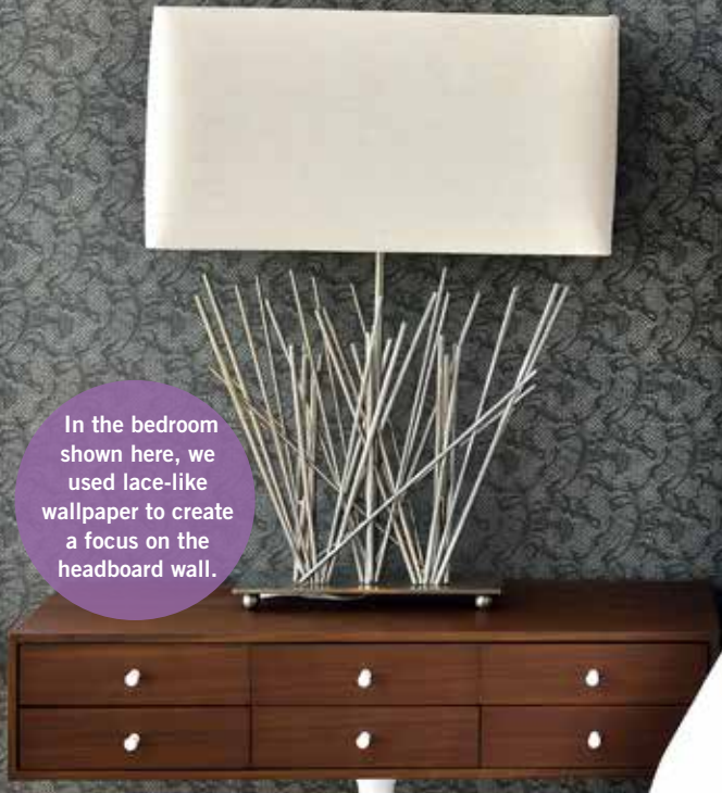
In the bedroom shown here, we used lace-like wallpaper to create a focus on the headboard wall.