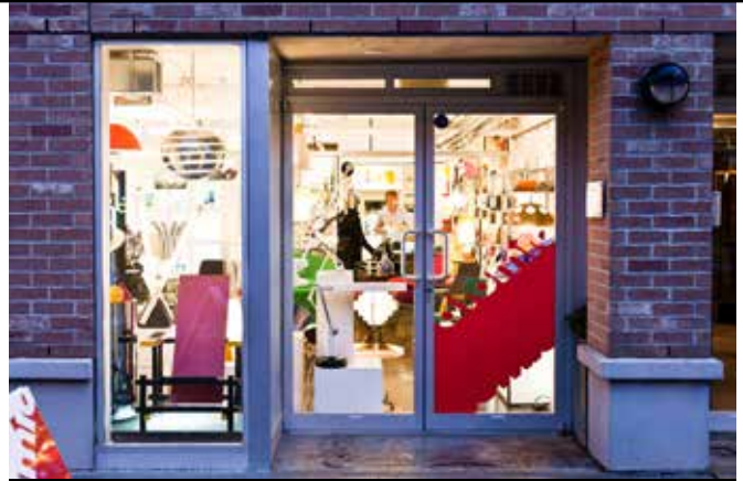
Atomic Design (965 Queen St. W., atomicdesign.ca) features mid-century modern classics, lighting from the '60s, wonderful bits of art glass, a good collection of Canadian-industrial designer work and a generally great selection of accessories to make you "cool".

If you're looking for a collection of space-saving, contemporary furnishings (great for condo living), look to Blvd Interiors (707 Queen St. W., blvdinteriors.com).