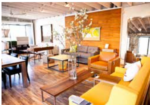
At Stylegarage (938 Queen St. W., stylegarage.com), if you don't find what you're looking for in store, they'll custom-make it to suit you and your space.

At some point you may need a coffee and a small nosh. Nadège Patisserie (780 Queen St. W., nadege-patisserie.com) is a beautiful place to grab a bite. Their macarons rival those at Ladurée in Paris (laduree.com). Just a guilty pleasure I thought I'd share.