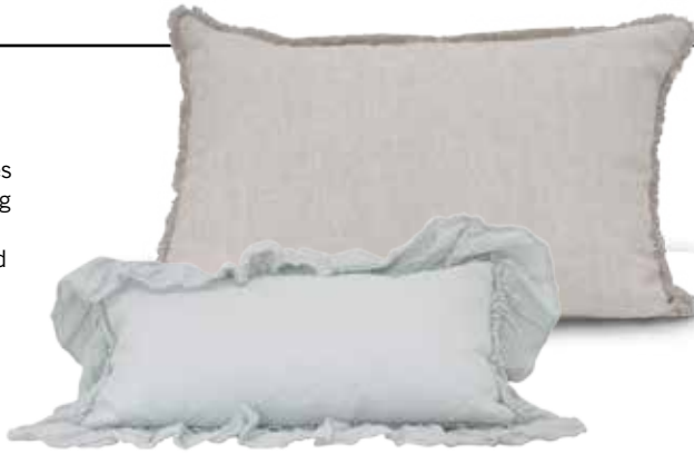
Throws and toss cushions Natural & White. 16 x 24-inch, $44. Bella Notte Whisper, White & Silvermist. 12 x 24-inch, $193. Monaco Stone Throw , 50 x 70-inch, $176.

Throw blankets of finished cotton or knitted cotton are soft to the touch and casual in look.