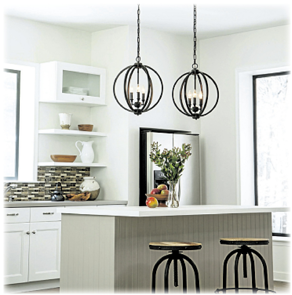
If you are considering a major renovation of a home, be sure to incorporate as much natural light as possible.

• When in doubt — best to hire a design professional.