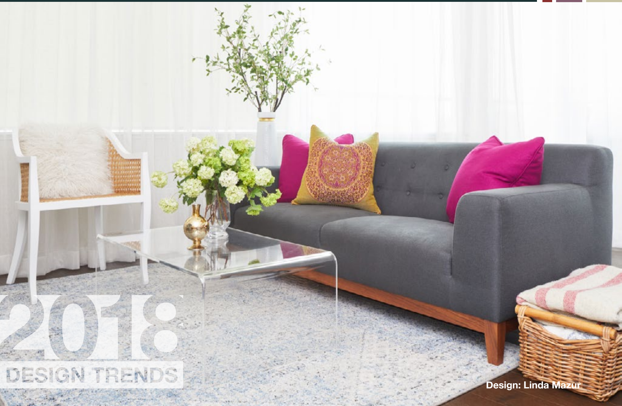
Design: Linda Mazur

When looking to add color to your spaces, the mainstay of paint, furnishings and accessories are always first and foremost in your mind; however, color can be introduced in many other forms. Luxury British bathing brand, Victoria+Albert has introduced their free-standing tub collection, currently available in six new finishes, including a rich gloss black and beautiful Antracite, which is a great color and design inspiration to create a style all your own. A colored free-standing tub can be just the perfect complement to gold toned bathroom faucets and fittings, creating a luxurious “spa-like” oasis.