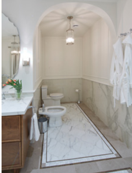
Custom cut floor tiles stay toasty warm with infloor heating by Nuheat.