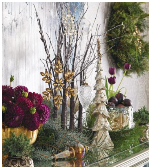
Use greenery, holiday ornaments and a bit of shine in places around your home for a festive touch.

A beautiful floral arrangement is the perfect accompaniment to the holiday season. Go for a display that features rich, lush plum tones, with a great play on texture. Who could ask for anything more?