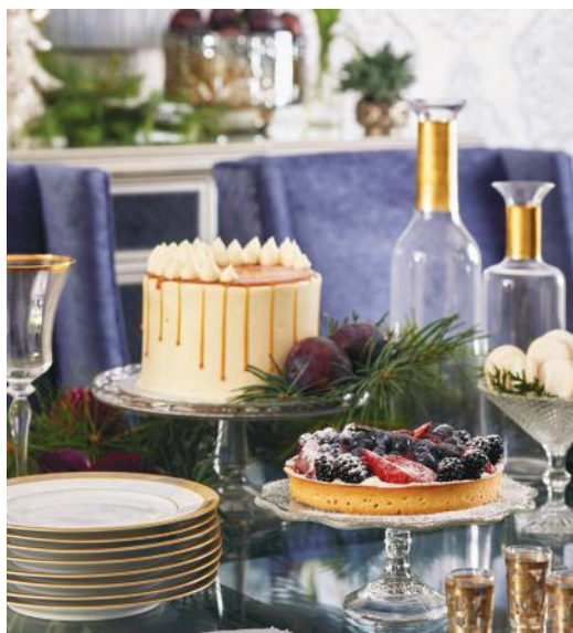
Vintage cake plates in a variety of heights help create a beautiful dessert table-scape.