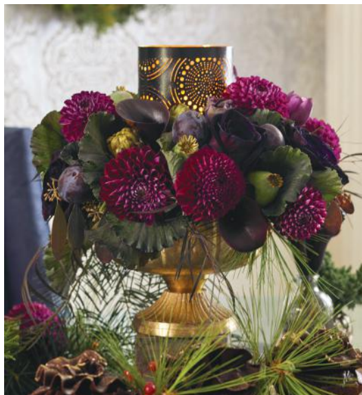
Go for sophisticated floral arrangements featuring rich shades of plum along with texture.