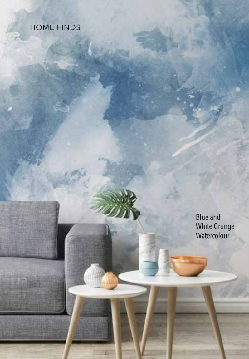
Blue and White Grunge Watercolour