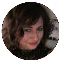
SILVANA LONGO EDITOR

With pared-down, linear forms and signature-crossed corners, this brass-clad mirror evokes the esthetic of the Arts and Crafts movement, circa 1900. The frame is tightly wrapped in brass with handwork that creates a striated effect and gives each piece distinct textural and tonal richness.