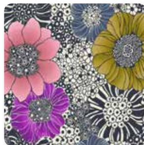
Anemones by Missoni