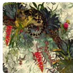
Tropical Clouded Leopard by Timorous Beastie