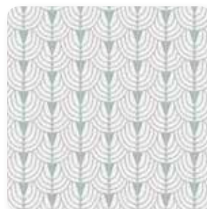
Camille by Coordonne